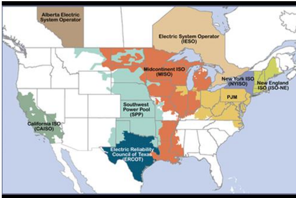
Figure 2: Different RTOs in America 11

The MBED proposal admits that European experience is actually more similar to the Indian case. However, by focusing on the Nord Pool Elspot example, it selectively represents the European power market experience. The Nord Pool spot market is a corner case where over half of the power generated in the pool comes from hydropower, lending the market an unusual amount of predictability and stability. This makes the implementation of a spot market much easier. The broader European power market does not have a similar market structure, but rather has been going through gradual geographic integration across various markets 12 : Bilateral, Day Ahead, Intra-Day, Ancillary Services, derivatives like Contracts for Differences. Organizations like the European Network of Transmission System Operators - Electricity (ENTSO-E) have been working for over five years to improve data-sharing, interoperability standards, and regional cooperation to a point where these various markets can operate and clear simultaneously across countries. 13 But nowhere in this system are there Locational Marginal Prices (LMPs), the way there are in America. Europe is still able to run a vibrant, efficient electricity market while simultaneously scaling up RE generation in a big way. Clearly there are multiple paths to “efficient” dispatch solutions. These diverse experiences deserve serious consideration.